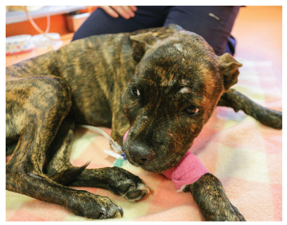
Above: Evie suffered terrible abuse and needed urgent and extensive medical treatment